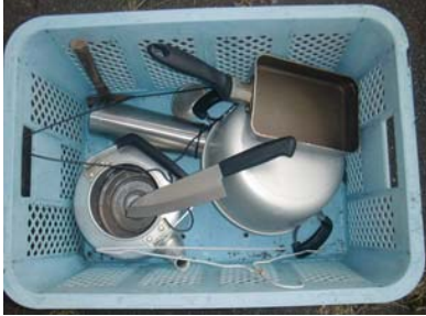
★Pic 1: Cooking knife unwrapped and thrown into basket.

Recently in Koka City, a child accidentally touched blade at garbage location and hurt him/herself. The blade was unwrapped. Currently, Koka City is defining cooking knives (包丁ほうちょう), knives and such as Metal, Non-Burnables (Kinzoku gomi, 金属ごみ) and small blades such as razor blades, cutter blades as Landfill, Non-Burnable (Umetate gomi, 埋立ごみ). Therefore, each area dispose those items in the basket separately (the basket is called "bunbetsu kago 分別かご", separate basket.) at designated location on designated day.