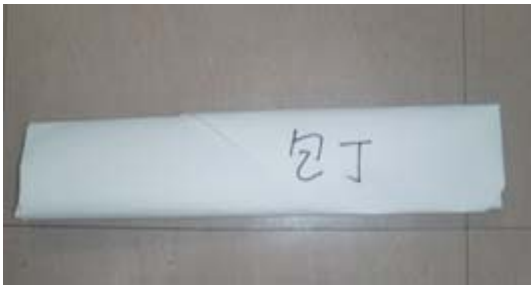
★Pic 2: Cooking knife (包丁) wrapped and named on it.

However, it is not that rare to find the blades thrown into the basket unwrapped. (Please see the pic 1.) Someone might touch it accidentally; also it is dangerous when they are collected. When you disposing dangerous goods such as blades, please wrap it with paper and such and write down what it is. (Please see the pic 2.) Please dispose garbage on designated day. Thank you for your cooperation.