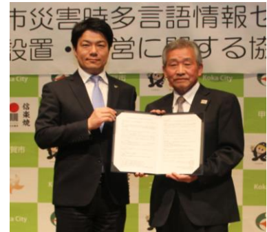
Above: Mayor (left) and the President of Koka International Society holding the agreement signed between both parties.

On February 18th, Koka International Society and Koka City have signed an Agreement for Setting Up the Disaster Headquarters. When a disaster occurs, this headquarters will be established to provide comprehensive support such as publishing disaster information in multiple languages. The headquarters will be operated, in coordination with Koka City, by Koka International Society.