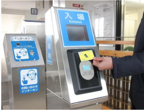
ICOCA ticket gate

Starting March 17th (Saturday), you can use ICOCA Card to ride JR Kusatsu Line between Konan and Tsuge (Konan, Terasho, Koka, Aburahi and Tsuge station). Koka City is currently working to increase the valid stations in all JR Kusatsu Line. ICOCA Card can be charged at the ticket vending machine set up at these stations.