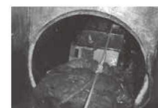
Bedding and a TV dumped into a waterway later clogged up the pipe channel

During periods of heavy water flow, the area around the canal can become extremely dangerous. You are encouraged to stay away from waterways, especially during typhoons and heavy rain, as there is a danger of the water rising.