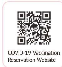
COVID-19 Vaccination Reservation Website

Inquiries COVID-19 Response Office TEL.0748-69-2154 FAX.0748-69-2255