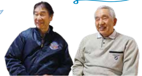
Bantani Area Exchange Study Club

We want to continue to provide a place where children who have roots in foreign countries can feel at home.