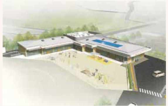
▲ Conceptual drawing of Shigaraki Kodomoen

*From April, Tsuchiyama, Ohara, Aburahi, and Shigaraki Nikoniko-en kindergartens and nursery schools will be reclassified as Certified Childcare Centers.