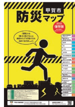
◀ Koka City Disaster Prevention Map 2022 Edition

By using the Disaster Prevention Map, you can create your own evacuation action plan (My Timeline) and complete the map so that you can take fast action in the event of an emergency.