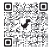
▲ Koka City Website

Inquiries Kikikanri Ka ☎ 69-2103 ☎ 63-4619