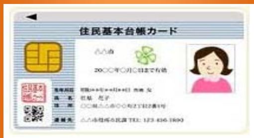
<Resident Card-Jyuki Card 住基カード>

To those who doesn't have Resident Card, you can apply for it on 7/13 (Sat) and 14 (Sun) . We will set Resident Card issuing counter for both days. Please use this opportunity for your convenience. By using Resident Card, you can get copies of resident certificate (jyumin hyo), registered seal certification (inkan shomei) and such from automatic machine. Automatic issuing Machine is available on weekdays 8am to 8pm and 9am to 5pm on day offs.