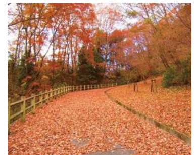
Walking paths with beautiful autumn leaves