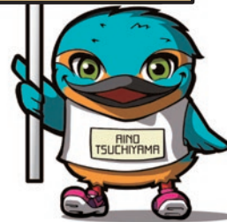
▲Aino-Tsuchiyama Marathon Mascot Character "Aify"