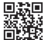
▲the Aino-Tsuchiyama marathon website