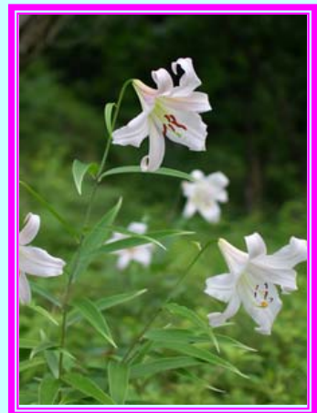
Flower of Koka: Sasayuri

The human rights groups and organizations work closely together.